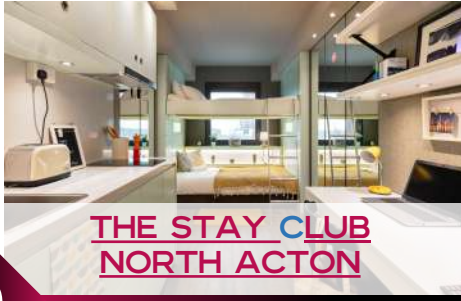
THE STAY CLUB NORTH ACTON

*PARTNERSHIP OFFER: 5% discount for the whole stay booking fee. Make sure you mention you are joining OMNES in London.